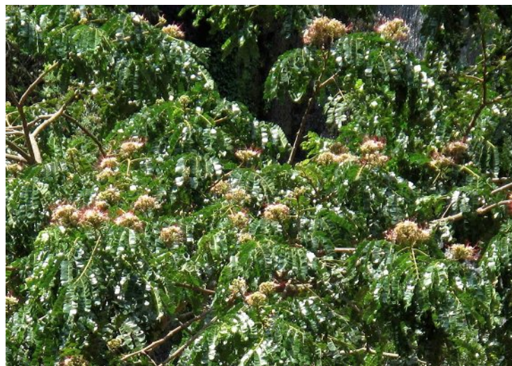
Figure 6. Albezia gummifera tree