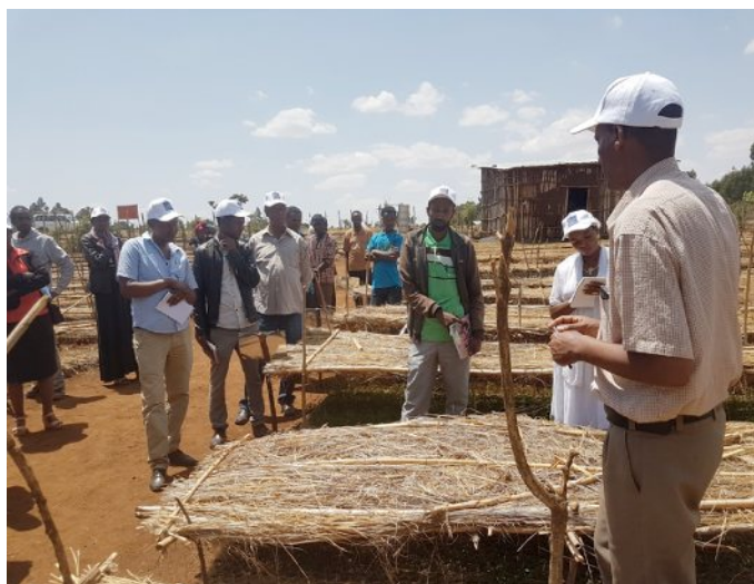
Figure 5. Nursery site visit by workshop participants at Kidus Yohanes

The flora of Ethiopia is diverse. There is around 6500-7000 species of plants, of which about 12-19% are endemic. Albezia gummifera is a threatened ingenious tree species in Ethiopia locally known as Sesa. It is a large deciduous tree that grows up to 15 m and forms a flat top crown. The species can grow up to 2500 m above sea level. It is one of the few national priority tree species which requires genetic conservation and protection from extinction. In the project area, only a few, scattered Albezia gummifera trees are found in fragmented communal and church forests. It provides a variety of different forest products, such as timber, firewood, fodder, bee forage, shade, nitrogen fixation, soil conservation, medicine and more. It is highly valued as a shade tree for cash crops, e.g. in coffee plantations and as bee forage for good honey production. The project aims to plant 14,340 of these trees in different land use types, mainly farmlands and communal forests.