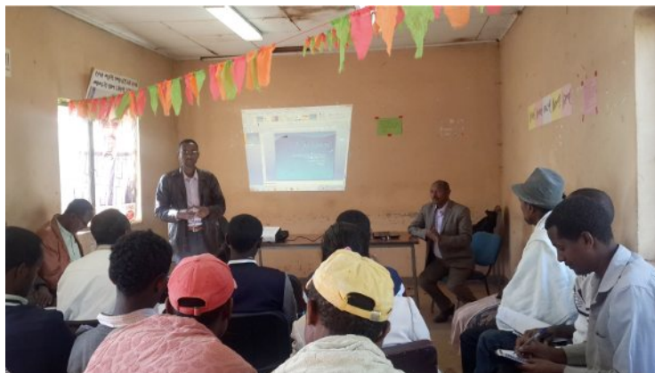
Figure 4. Discussion with community members to identify and designate plantation sites for 2017