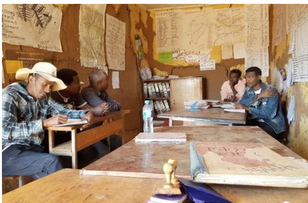
Figure 3. Meeting with village administration and natural resources experts on project activities and planning

During this reporting period, a district level task-force was established with 11 members, representing all stakeholders: community representatives, the District Administration, Bureau of Agriculture, Environment Protection and Land Administration, Bureau of Micro & Small Enterprise Promotion, Bureau of Cooperatives Promotion and Bureau of Finance and Economic Cooperation. The task-force meets on a quarterly basis and is responsible for the overall facilitation of the project implementation and progress evaluation. Committees at village level were also established, with 11 members in each village task force. Chosen by the communities, members include the Kebele (village) administrators, respective development agents of the government offices, local elders and community leaders, nursery managers and THP Epicenter Community Committee representatives. These committees meet on a monthly basis and are responsible for the local community mobilization and community participation in the project implementation processes and sustainability. Both types of committees will ensure that the project is tailored according to the needs of the communities and owned by them. This will ensure the long term success of the project.