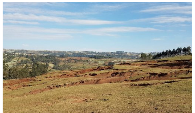
Figure 2. Gullies scatter the degraded landscape

Around 835,000 seedlings are growing at the project's three nurseries; Kidus Yohanes nursery, FTC (Farmer Training Center) nursery and Gusquam nursery. All three nursery sites are managed by the project in collaboration with local communities and district natural resource office. The seedlings will be planted during the coming rainy season in the summer period (June - August). 15,000 of these are economically valuable trees, like fruit trees, to be planted on 329 homesteads. These include Persia americana (Avocado), Malus domestica (Apple) and Coffea arabica (coffee). Improved and fast growing varieties of fruit trees are selected to improve cross pollination and produce more, high quality fruits. Native tree species are being prepared for planting in gullies to stabilize the soil and prevent further erosion. Trees for fodder production, such as Chamaecytisus proliferus , will be planted on community grazing lands, farmlands and gullies.