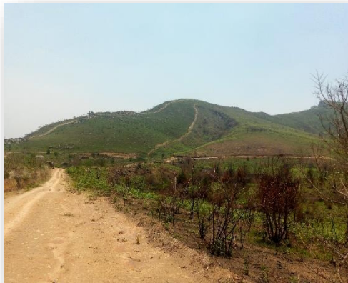
A firebreak on the peak of the mountain to stop any risks of wildfires spreading.

Forest fires are one of the main threats to biodiversity conservation in Mulanje Mountain Forest Reserve. Firebreak construction and maintenance has been found to be one of the main effective measures to slow or stop the spread of a low intensity bushfire. On the peak of Mulanje mountain the Nakhonyo community has been constructing and maintaining firebreaks where restoration and planting of Mulanje cedar and other species will take place. The community is paid for its efforts and so incentivised to be involved. They have managed to clear 99.47 km during the high fire risk months of July through to October. A total of 155 people were involved (116 men and 39 women).