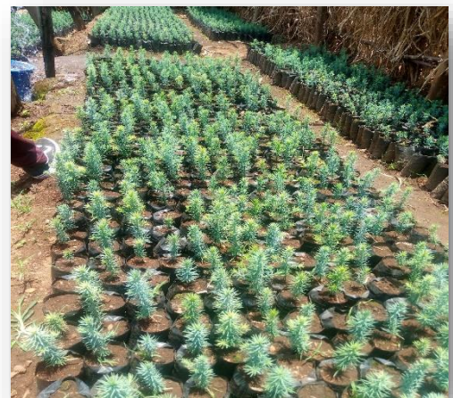
Cedar seedlings in Nessa Community Nursery

The Nessa Community Nursery is one of the five community nurseries we purchased cedar seeds from during 2019. The community group of nine men and three women raise the seedlings of Mulanje cedar and take care of them at the nursery until they are ready for planting. In addition to receiving income from the sale of the cedar the community will also be paid to transport and plant the seedlings.