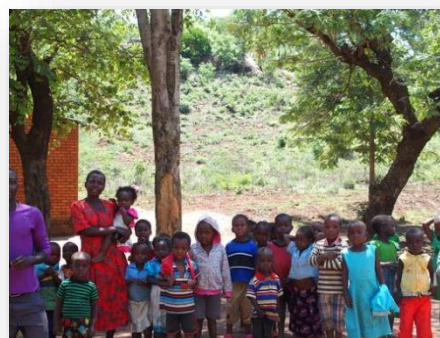
Schoolchildren in the project area

Seedlings of pine and cedar are purchased from local community nurseries, providing much needed cash income and employment for the communities around the forest reserve. The local communities are also involved in the planting of the trees as well as taking care of their survival in the long term. An education and environmental awareness program for schools will see ten schools raise and transplant seedlings that will eventually improve the school micro-climate, reduce soil erosion and improve soil organic matter and fertility. Some of the trees will be planted at home farms and will form part of agroforestry systems, making the farms more diverse, resilient, productive and sustainable, as well as producing additional benefits such as fodder for livestock. Around 500 grafted mango trees will provide an excellent source of nutrition for the children.