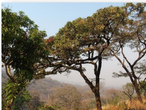
A mature Brachystegia tree – a typical species in the Miombo woodlands.

Our 2030 goal is to restore the equivalent of 30,000 football pitches (24,400ha), initially with only 90ha of indigenous miombo forest each year and 50ha of pine and cedar trees. The rate of restoration will ramp up significantly when our partner MMCT takes on the management of the reserve from the Government, which we expect to happen during 2020.