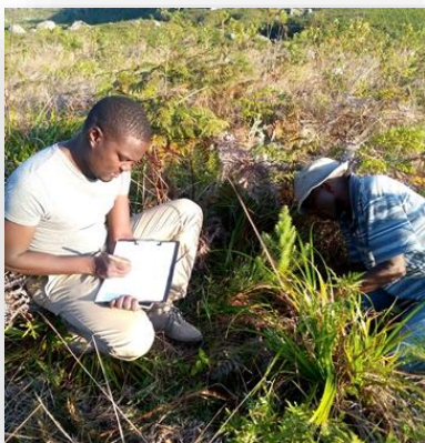
Data collection from planted cedar

Our data collection team studied experimental plots where cedar seedlings have been planted. This will give us a better idea of the restoration potential and help us to increase the survival rate of planted cedar trees.