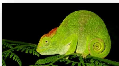
Nadzikambia – the Mulanje mountain chameleon

The structure and altitude of the mountain has led to the development of a unique climate for the area that favours the development of rare and endemic life forms. Several of these species are classified as vulnerable, endangered or even critically endangered by IUCN's red list including: The Mulanje Cedar tree ( Widdringtonia whytei ) is considered critically endangered, Mulanje Pygmy Chameleon