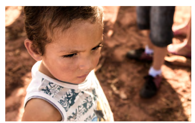
Figure 8. Children from the local communities benefit from the increased income of their mothers