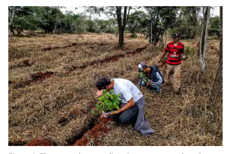
Figure 1. The team plants saplings in rows to speed up the natural regeneration of the forest at Rosanela Farm