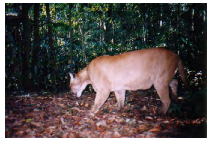
Figure 10. A puma ( Puma concolor ) is one of several feline species photographed by the cameras