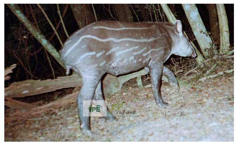
Figure 9. A tapir ( Tapirus terrestris ) listed as vulnerable on the IUCN red list

In September of this year, the project launched the "Selfies in the Forest" GIS Web platform, which shows footage of wildlife using the forest and forest corridors captured on camera traps and their location. This site will be updated on a weekly basis. These observations provide strong evidence of the effectiveness of corridors and forest landscape restoration for biodiversity conservation. The images below are some examples of the camera trap photos.