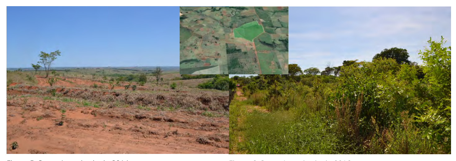
Figure 5. Santo Antonio site in 2014