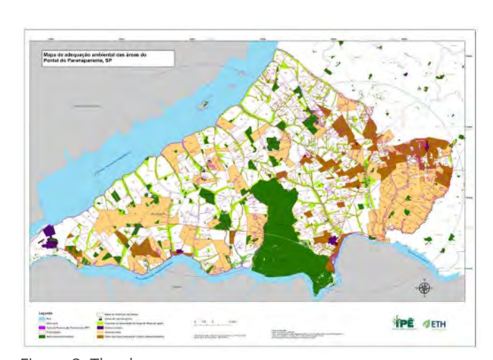
Figure 2. The dream map