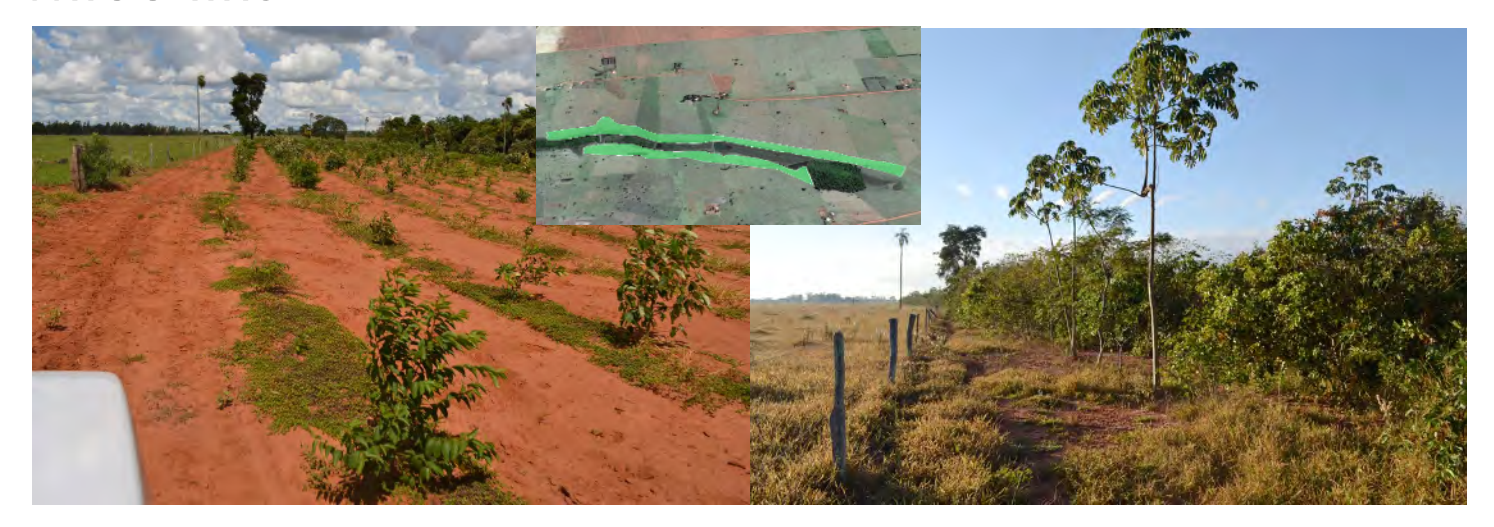
Figure 3. Arco Iris site in 2014