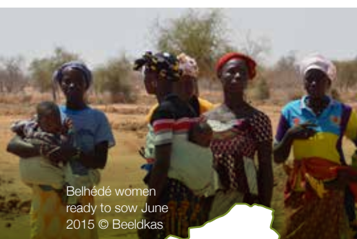
Belhédé women ready to sow June 2015

2015 was an exciting year for the planting activity: WF managed 5 active projects, completed 2 sites, started due diligence and planning on 3 new ones.