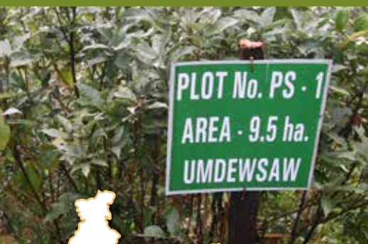
Slopy Khasi Hills need more trees to reduce erosion

A total of 833,000 trees have been planted and protected during 2015 (620ha). This was achieved thanks to the strong engagement of local people, who have developed income generating activities with the help of micro-loans, and the project's 77 community-based nurseries. The WF Director of Planting Projects saw first hand the strong engagement of the locals when she visited the project site in September 2015. Surrounding communities expressed their eagerness to get involved and interest to further expand this project. At local schools, several tree adoption ceremonies took place to engage and inspire children as well. The demarcation of an additional 500 hectares for restoration was completed.