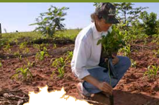
Preparing seedlings in the nursery before transplanting them to the field