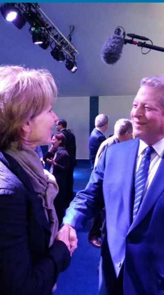
WF CEO talking to Al Gore in Paris December 2015 at COP21