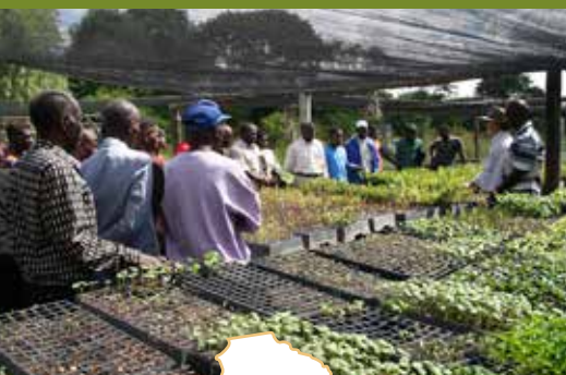
Training 75 farmers to plant trees on their land. April 2015

This project in the Copper-belt has strongly evolved since WF started working there in 2010. It was designed together with local private sector companies and farmer representatives back in April 2015. So far, 486 farmers have been trained in ANR (Assisted Natural Regeneration) techniques, silvicultural practices, etc. Efforts to promote woman entrepreneurship are underway through the training of local women fruit tree grafting with to aim to start-up home-based nurseries. The Miombo wood-lots where ANR will take place have been identified and a baseline study was started in order to measure the future projects impact on the environment, biodiversity and local communities.