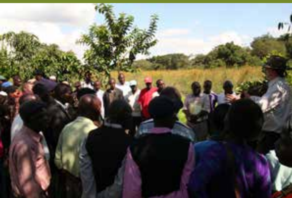
Training 75 farmers for them to plant trees on their land April 15

Want to join the global movement to Make Earth Cooler?