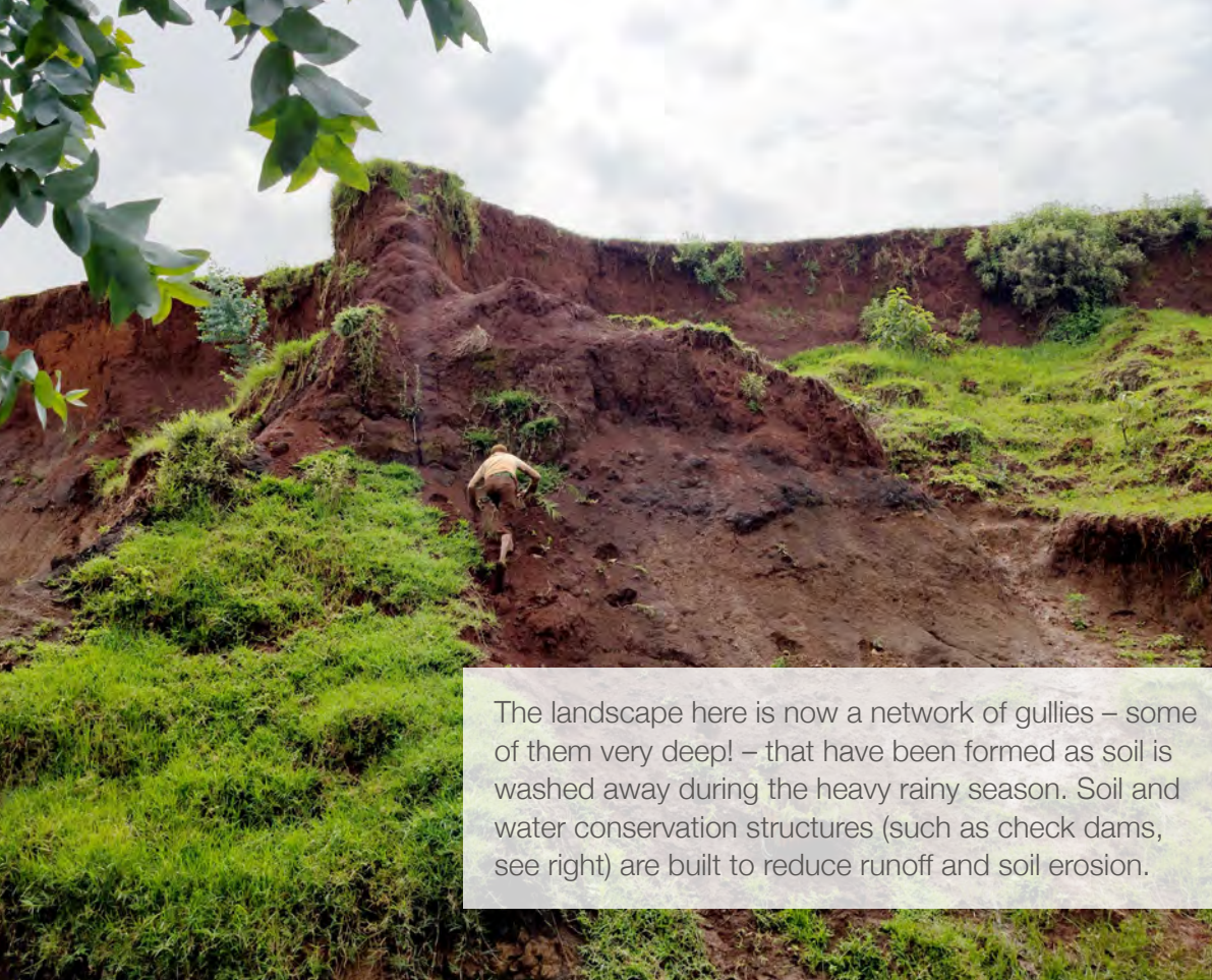
The landscape here is now a network of gullies – some of them very deep! – that have been formed as soil is washed away during the heavy rainy season. Soil and water conservation structures (such as check dams, see right) are built to reduce runoff and soil erosion.

on the 96.62 ha of communal lands, and 150 000 of the native species are destined for the agroforestry programme on villagers’ homesteads, which aims to diversify agricultural production and boost local incomes.